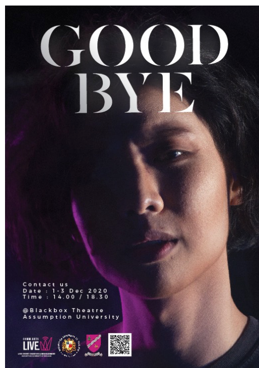
Figure 2 : picture of character of Chai in Good Bye : Stage play(2019)

This project has been started as I have mentioned in the paragraph above. It makes me think that if we could really make an audience to see some of the perspective the character of Chai and understand this character more, it might have some answers or understanding for audiences.